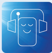
Complete Relaxation: Guided Meditation for Anxiety