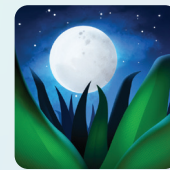
Relax Melodies: Sleep Sounds, White Noise & Fan