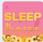
Sleep Easily Meditation