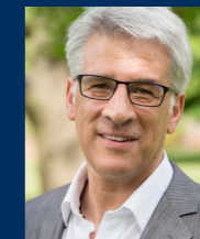
Steve Chalke, MBE

We look forward to meeting you and welcoming you into an Oasis academy in order to experience this for yourself.