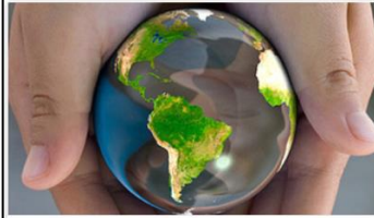
Building A Sustainable World

As members of the Oasis Community , we will be looking at our Global Goals. In Year 3, our Global Goal is 'Life Below Water.' This involves looking at features of coastlines and looking at the history of the '2-minute Beach Clean.'