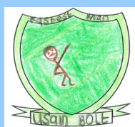
House 3 will now be Usain Bolt