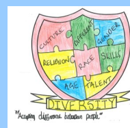
House 2 will now be Diversity House