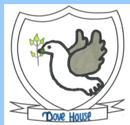
House 1 will now be Dove House

As many of you will know, the first competition in our new house system was to create a representative emblem and name for the houses. These shields will be used throughout the house system, creating an instantly recognisable brand for each house, along with a reminder of the values that we promote in our school community.