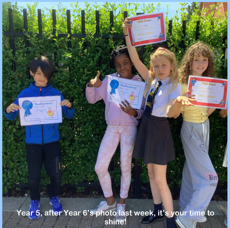
Year 5, after Year 6's photo last week, it's your time to shine!

Years 5 & 6: Upper KS2 celebrated the achievements of this year with a special assembly. Even COVID can't stop us from saying "Well done!"