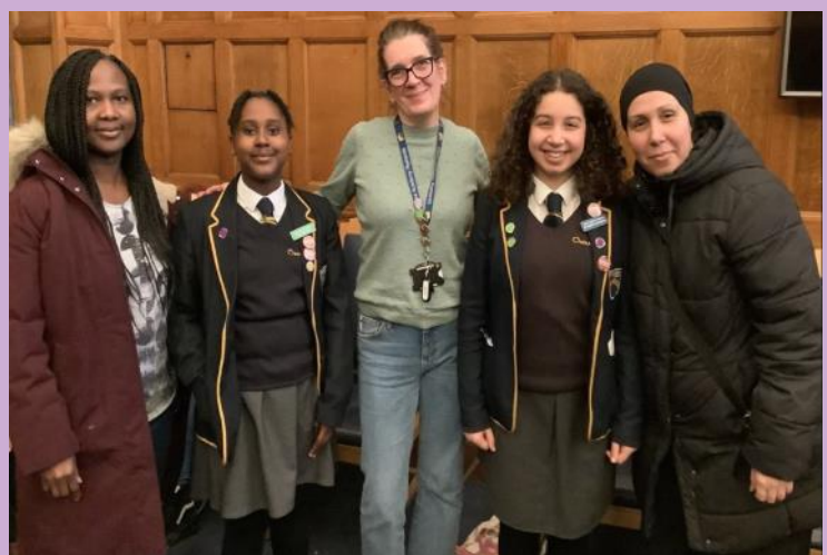
Making their Mums and teacher very proud indeed.