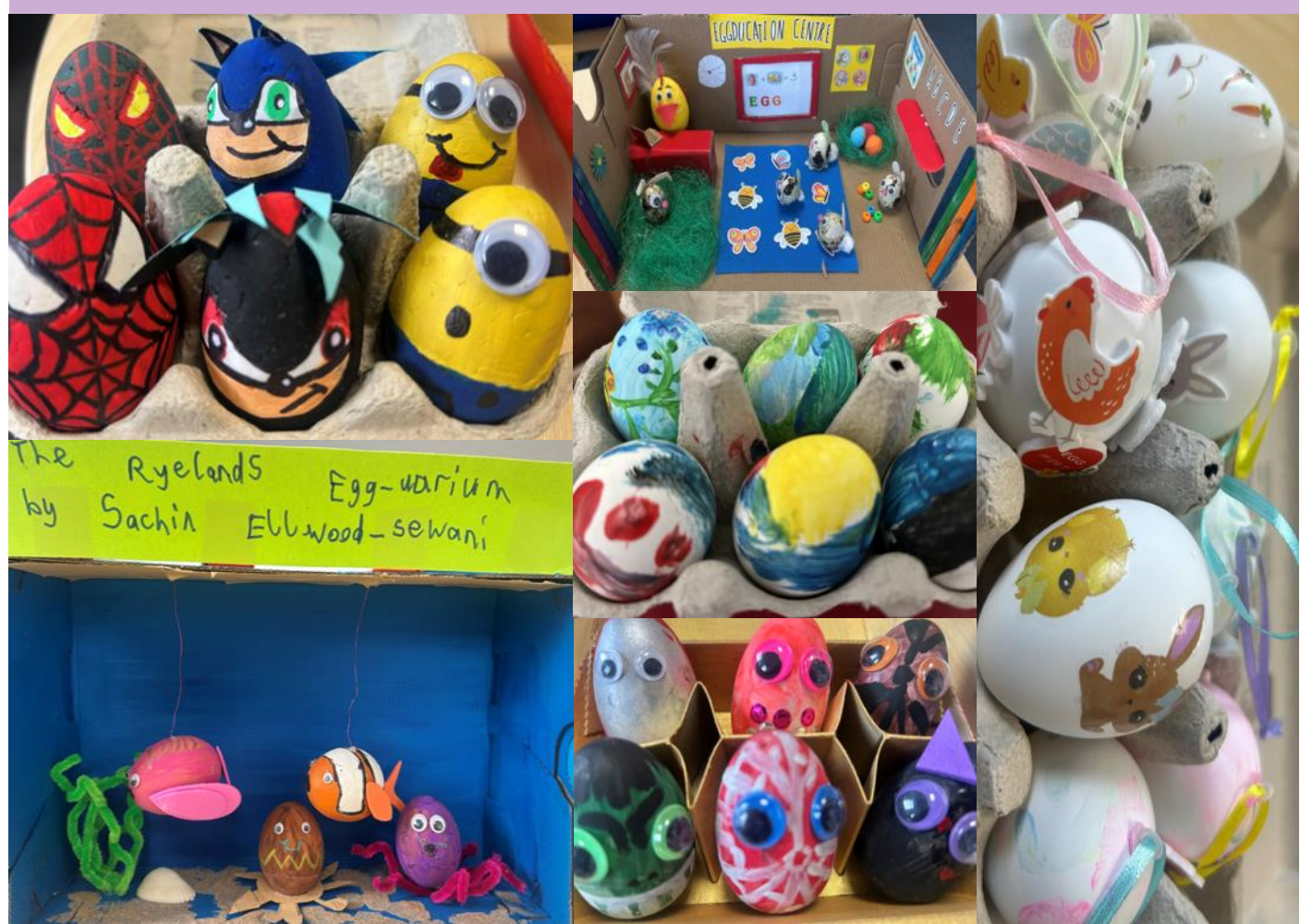
The Ryelands Egg-uarium by Sachin Ellwood-sewani